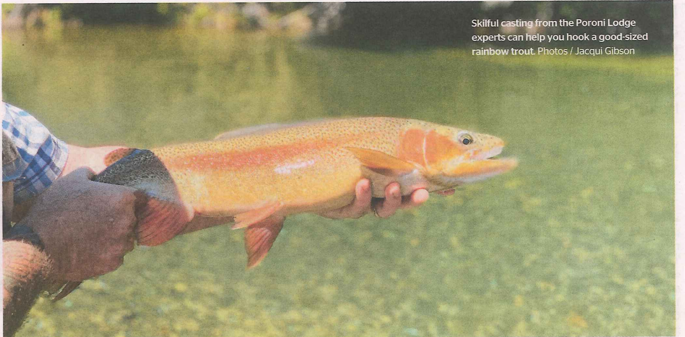
Skilful casting from the Poronui Lodge experts can help you hook a good-sized rainbow trout.

Soon, we're driving along Poronui's rugged dirt tracks en route to the winding Mōhaka River, spotting wild sika deer dashing through scrubland as we go.