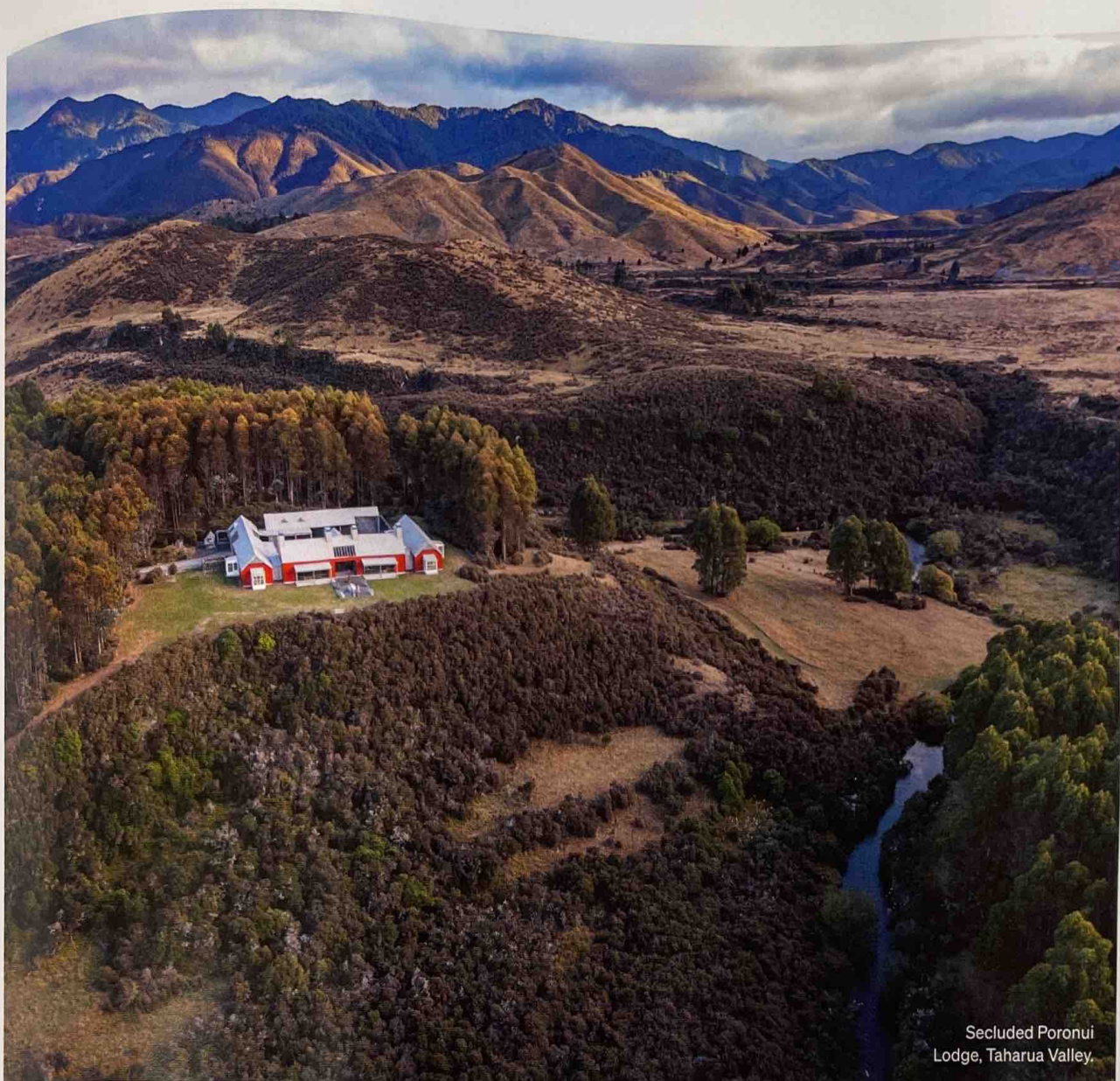
Secluded Poronui Lodge, Taharua Valley.